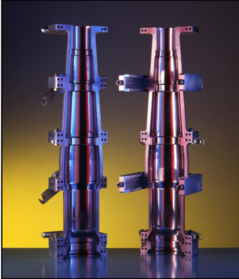
Complex mould tool (7kg shot)

PDM has been designing and manufacturing bend control products for 15 years. It has experience of several different technologies, but concentrates primarily on the polyurethane moulded bend limiter.