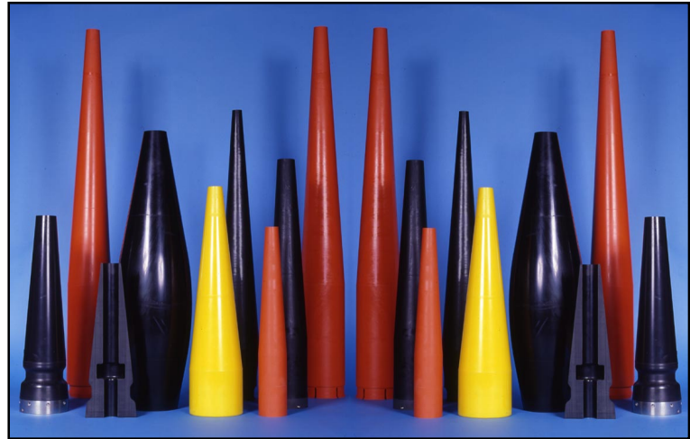
Polyurethane Bend Limiters

In a simple cable termination, the stress concentration around the fixing can cause the cable to fracture with cyclic bending. The bend limiter is designed to prevent this by ensuring a smooth cable curvature. This is achieved by adjusting the cross section of the device from base to tip.