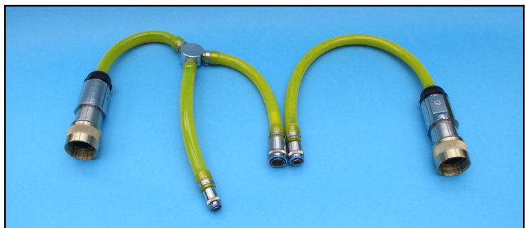
RDD-EuroFighter Cable Assemblies