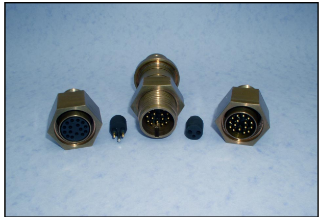
PDM 516 Connectors for TYPE 45

PDM has developed a good working relationship with MOD contractors based on its experience and its ability to produce high quality, competitively priced, products. It also has the necessary management and quality structures in place to handle defence projects.