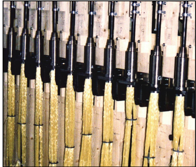
Production fibre optic terminations

The penetrators are available as either dedicated fibre optic components or as hybrids, with a combination of optical and electrical cores. With the development of new safety regulations, hybrid fibre optic units offer a safe solution to the combination of power and signal transmission in a single cable.