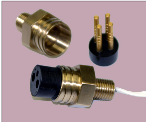
Impulse micro wet pluggable connectors

The connectors have already been used in major projects including new underwater vehicles. The product is usually a stock item and is available from PDM Neptec. PDM offers a rapid termination and moulding service. It also offers a comprehensive harness design and manufacturing facility at Alton.