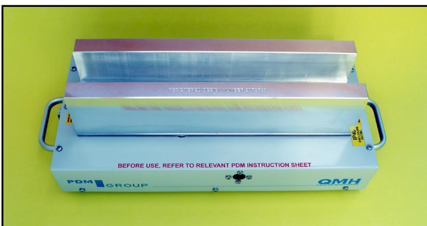
The 1-slot QMH

The QMS comprises a Quickcure Moulding Heater (QMH), special moulds for the type of joint, sachet based twin pack elastomers, release agents & primers as required. The QMH is temperature controlled to ensure the correct cure temperature for the elastomer. PDM elastomers are packaged in such a way that no weighing or evacuation processes are required.