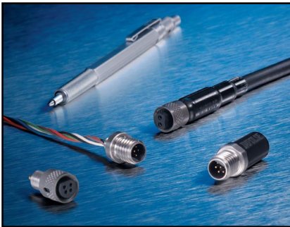
Subminiature IE55 Connectors

The standard IE55 subminiature connectors, IE55-1200, are available with 4 to 6 contacts. To enhance the scope of applications a wet pluggable version, IE55(W)-1000, has been developed with 2 or 3 contacts.