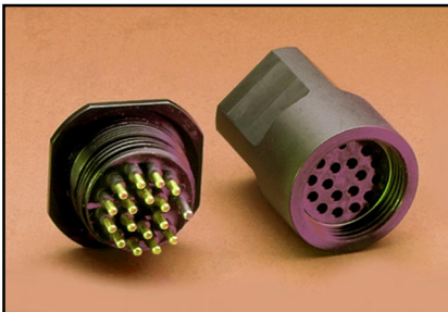
16 way PDM Transition Zone Connector

The transition zone line connectors are moulded in neoprene or polyurethane. They are available, as standard, in bulkhead and in-line design with 2, 6, or 16 pin contacts. Special configurations can be produced to customer requirements.