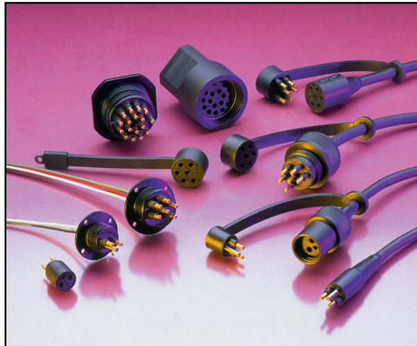
PDM Transition Zone Connectors

Quality and reliability were essential considerations in the development of this product and to support it PDM offer a comprehensive termination and moulding service. These connectors have recently seen use in large scale projects and have performed impeccably.