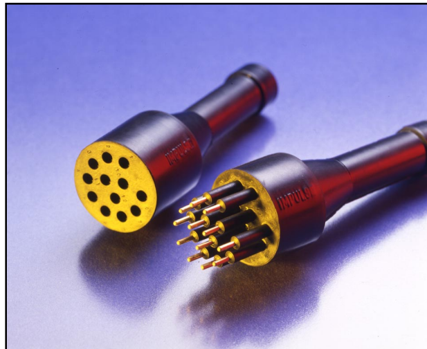
12 way Wet Pluggable connector

These connectors are well proven in a variety of applications and the test house. They have been widely used by a number of leading organisations such as IOS, MAFF, & the Woods Hole Oceanographic Institute in addition to the offshore and defence industries.